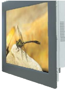
Panel Mount (5mm front bezel)