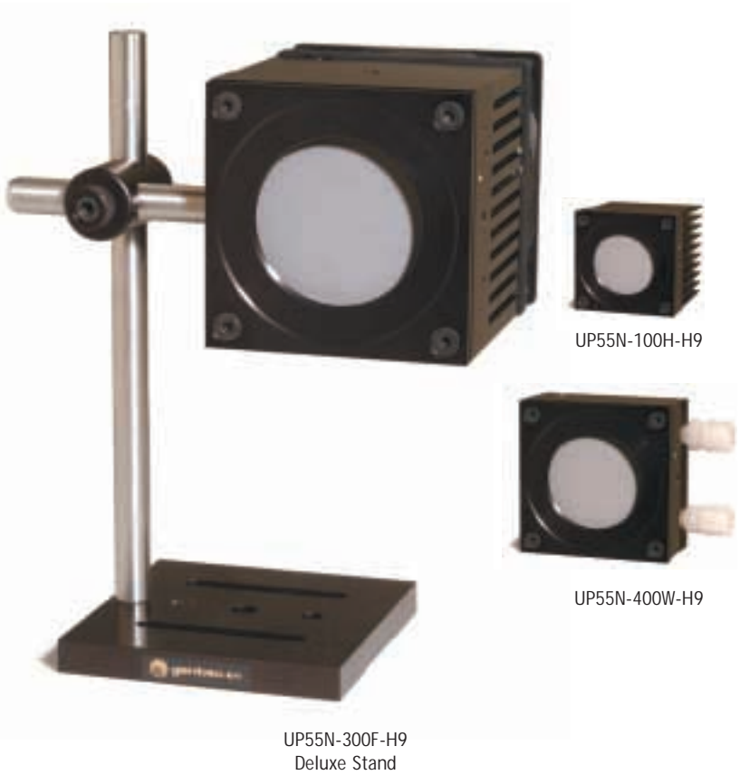
UP55N-300F-H9 Deluxe Stand