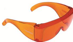
#700 Medium / #900 Large