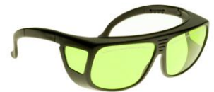
#36 Medium / #38 Large Universal