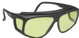
#31 Small / #39 Large Universal